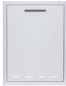
18-Inch Single Trash/Propane Drawer

Available as single trash/propane storage drawer, double trash/recycle drawer, and narrow single trash drawer models.