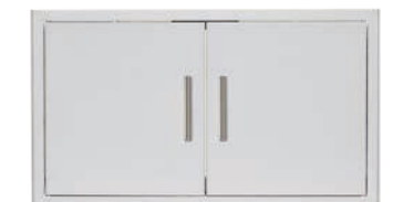
Dry Storage Cabinet