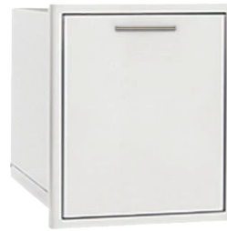
Double Trash/Recycle Drawer