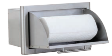
Paper Towel Holder