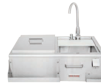
Blaze Beverage Center

Allows you to build your kamado into an outdoor kitchen for a finished look.