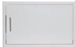
Single Access Horizontal Doors