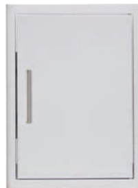
Single Access Vertical Doors

All Blaze cabinetry is produced in the USA and comes standard with soft close doors and drawers equipped with automatic on/off LED lights.