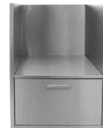
Kamado Island Sleeve with Drawer