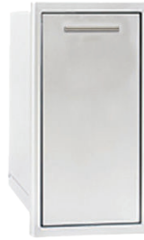
Narrow Trash Drawer