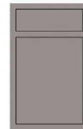
Standard Door Style