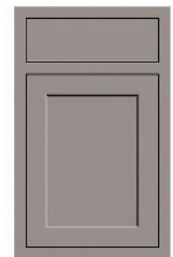
Shaker Door Style