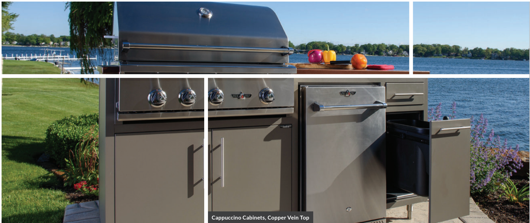
Cappuccino Cabinets, Copper Vein Top