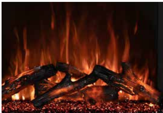
Orange Flames - Logs on