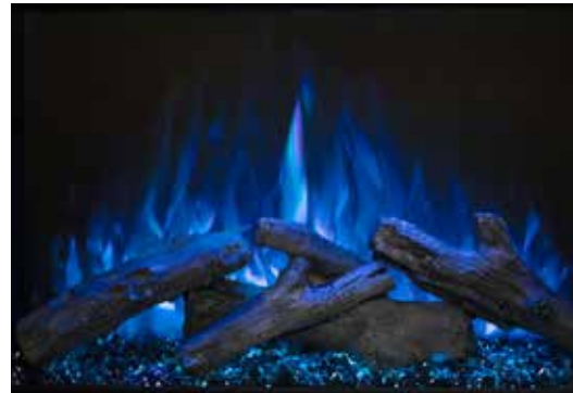
Blue Flames - Logs off