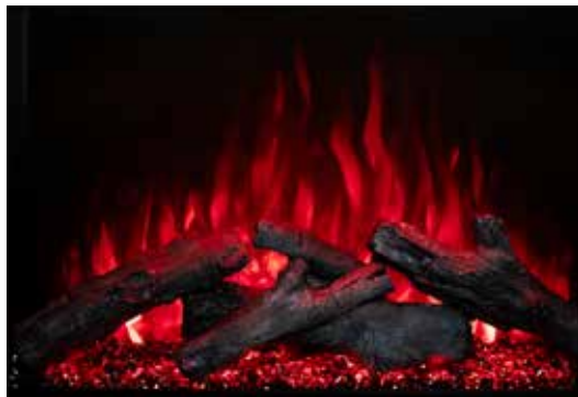
Red Flames - Logs off