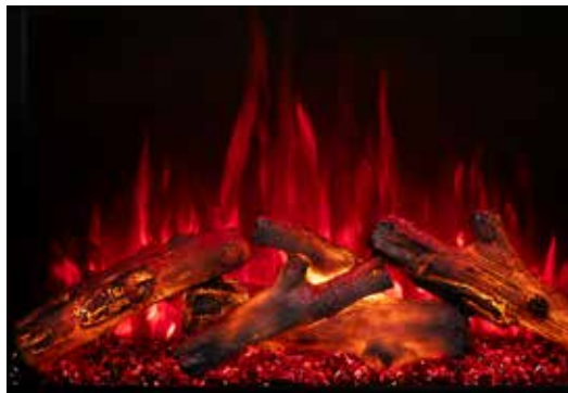
Red Flames - Logs on