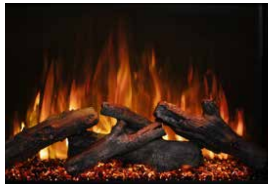
Orange Flames - Logs off