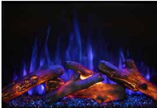
Blue Flames - Logs on

Flame & Ember Bed Colors Controlled Independently